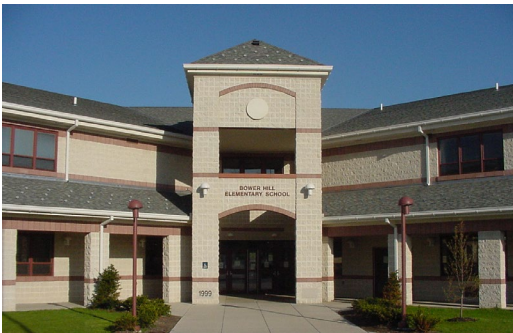
Bower Hill Elementary