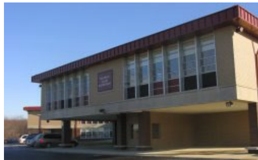
Pleasant Valley Elementary